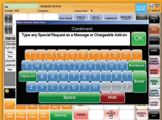
Free Text Messaging