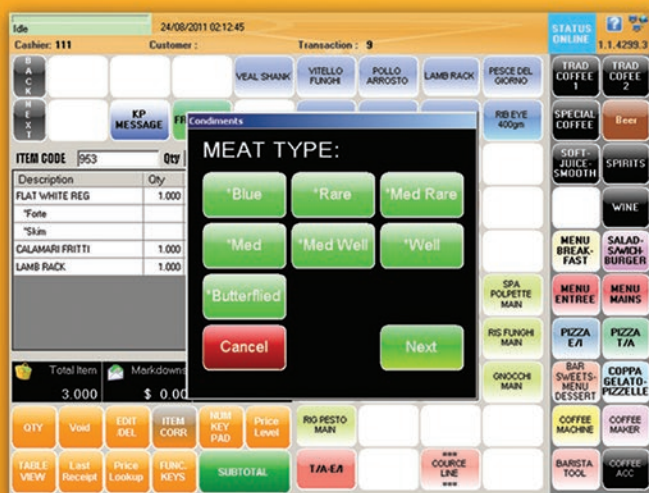
Forced and On-demand Condiment Selection