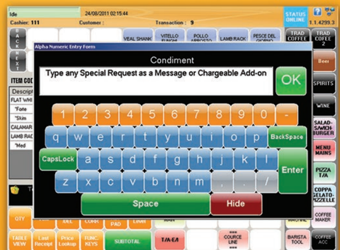
Free Text Messaging